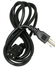
Power Cord (U.S. Version Shown)

WARNING: Please remember to set the power supply to your local outlet voltage prior to plugging in the power cord. Failure to do so may damage the power supply.